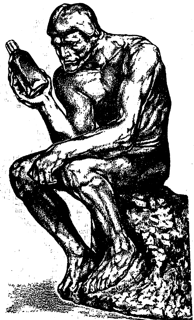
A public service of the Idaho Advertising Federation & Idaho Newspaper Association.