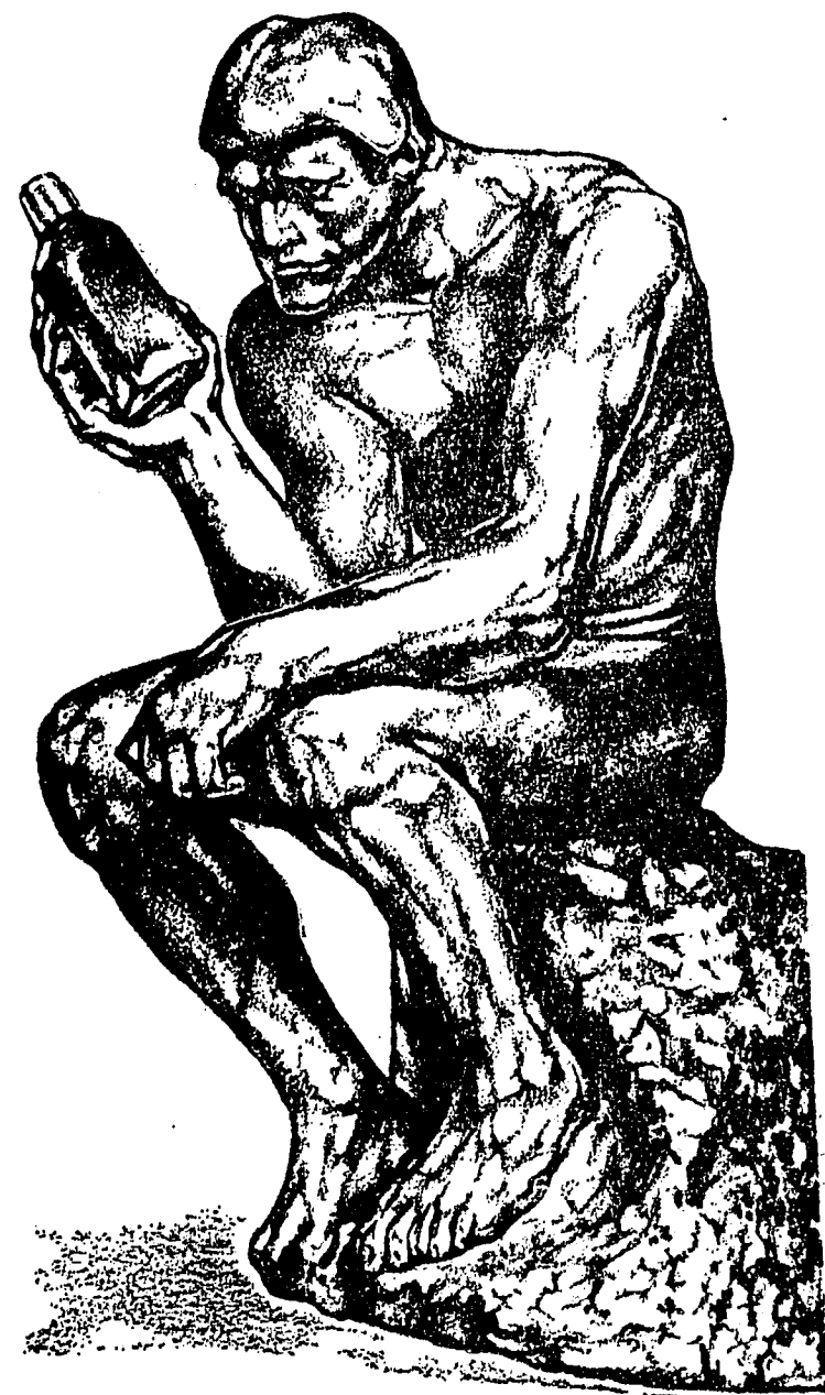
A public service of the Idaho Advertising Federation & Idaho Newspaper Association.