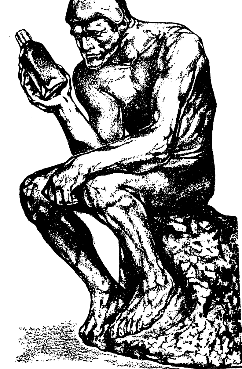
A public service of the Idaho Advertising Federation & Idaho Newspaper Association.