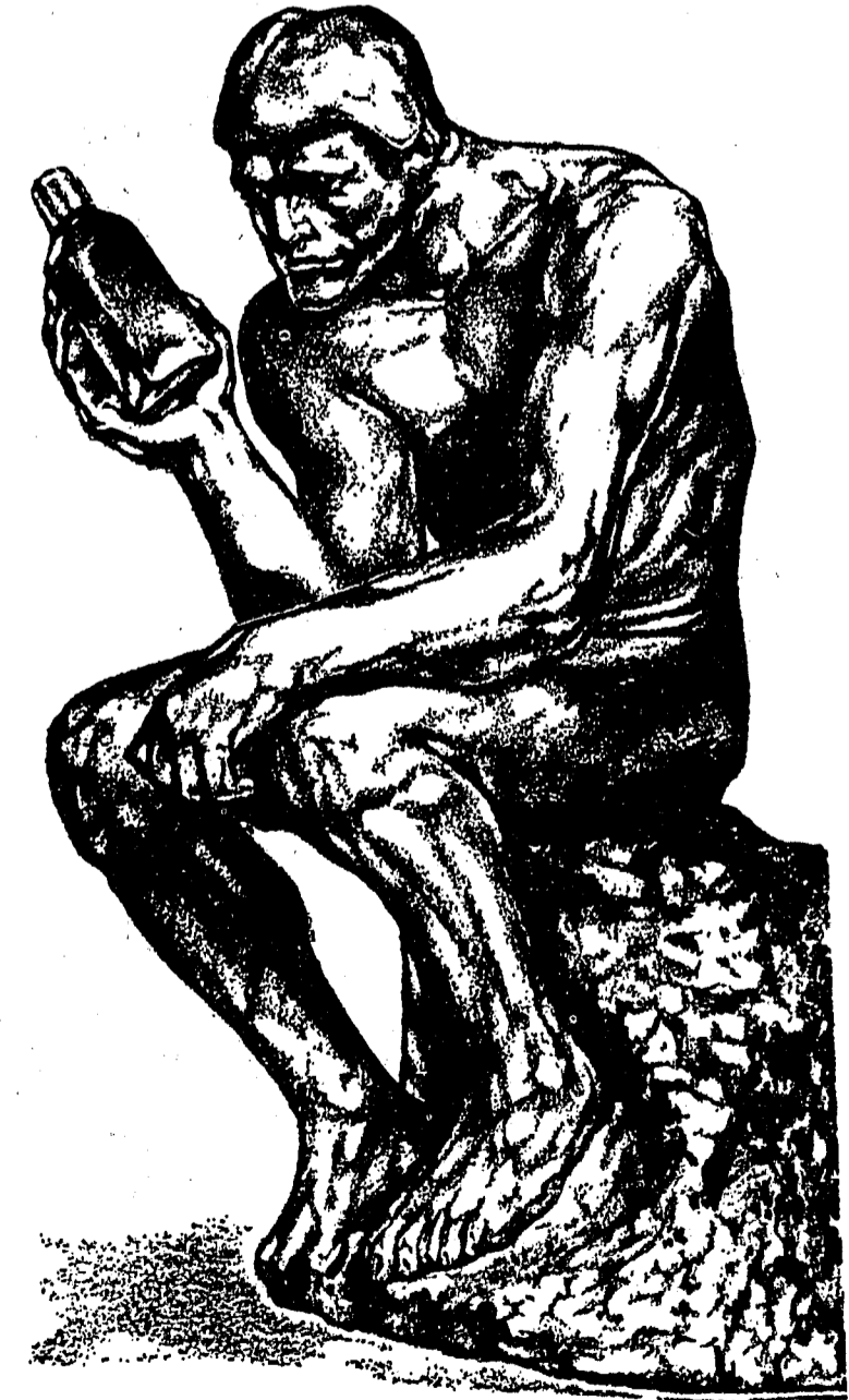
A public service of the Idaho Advertising Federation & Idaho Newspaper Association.