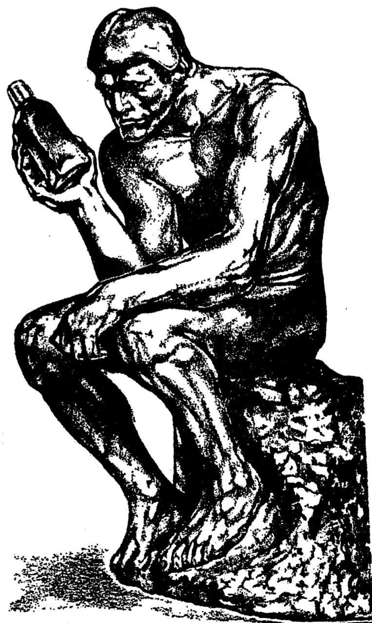
A public service of the Idaho Advertising Federation & Idaho Newspaper Association.