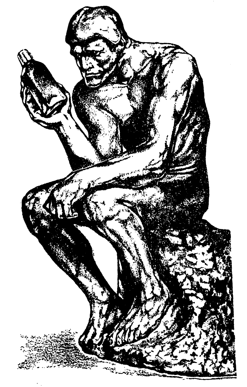
A public service of the Idaho Advertising Federation & Idaho Newspaper Association.