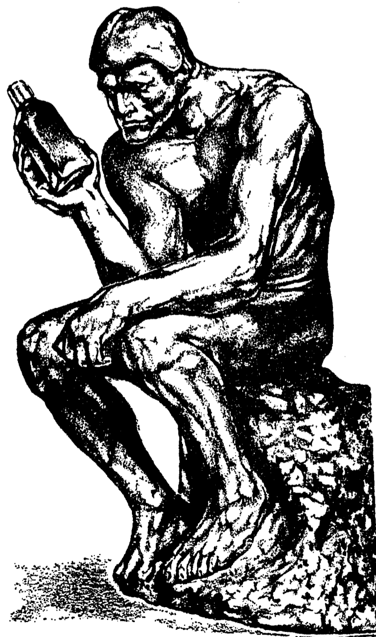
A public service of the Idaho Advertising Federation & Idaho Newspaper Association.