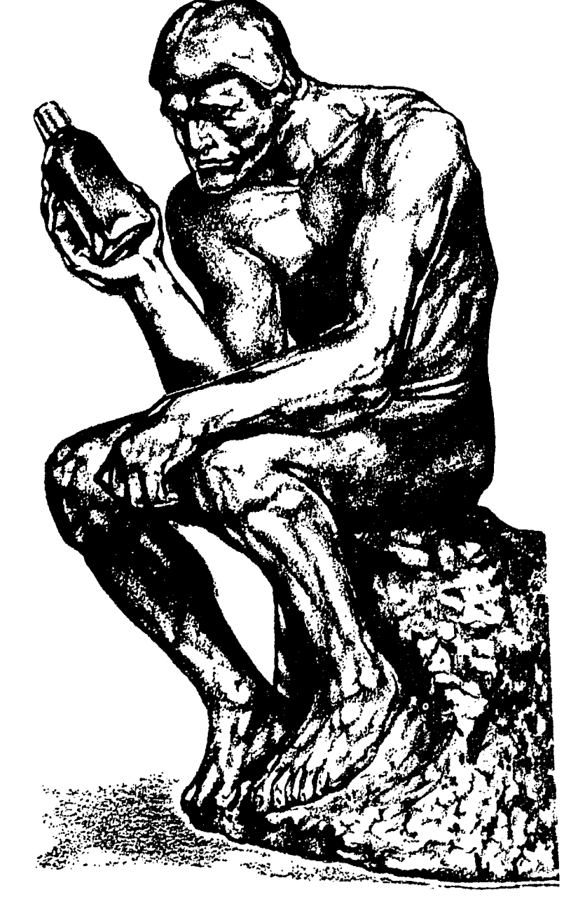
A public service of the Idaho Advertising Federation & Idaho Newspaper Association.