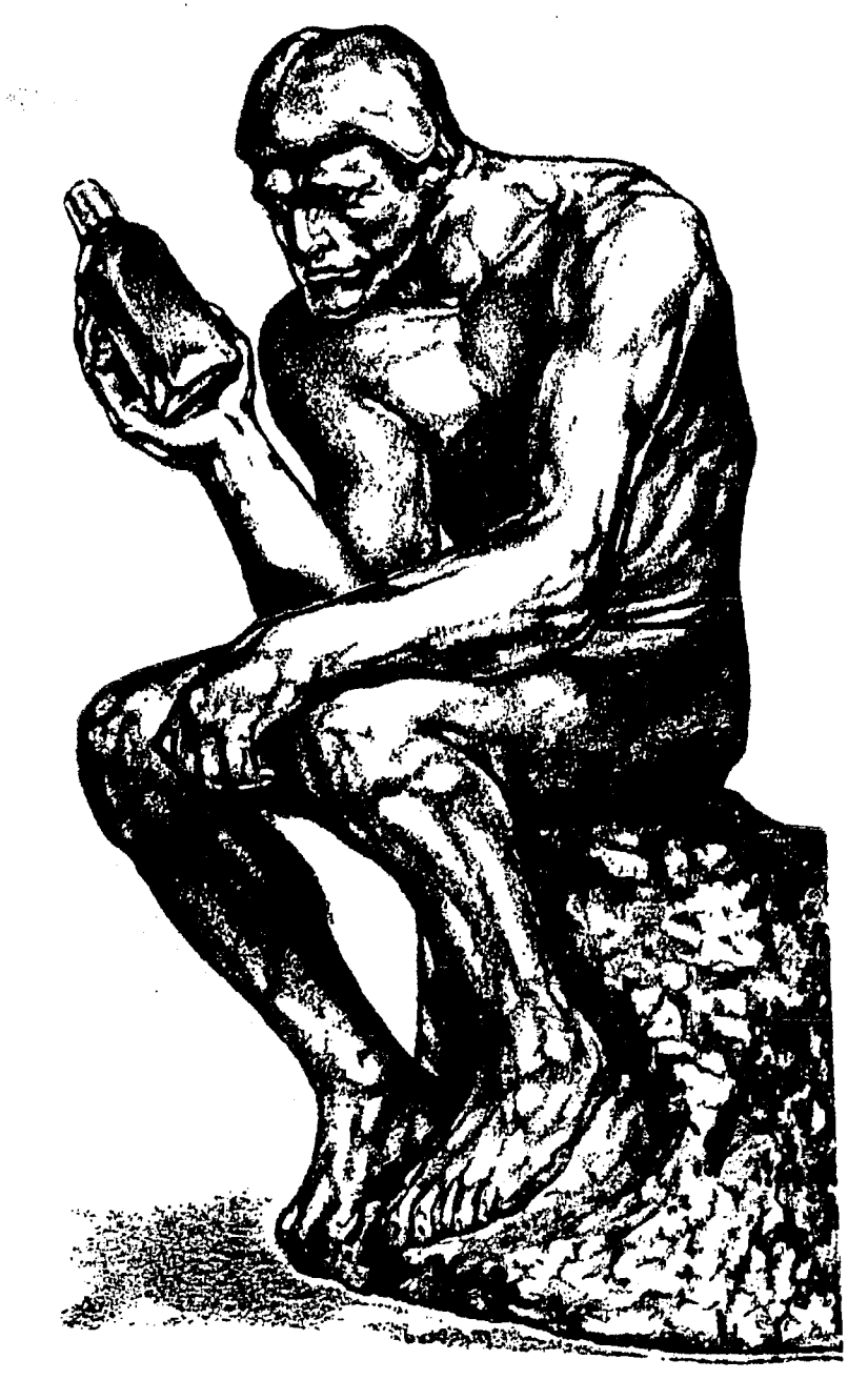
A public service of the Idaho Advertising Federation & Idaho Newspaper Association.