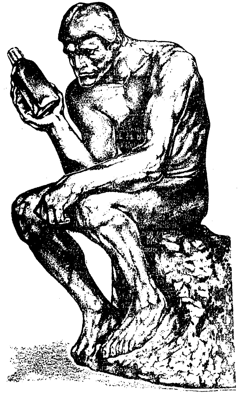
A public service of the Idaho Advertising Federation & Idaho Newspaper Association.