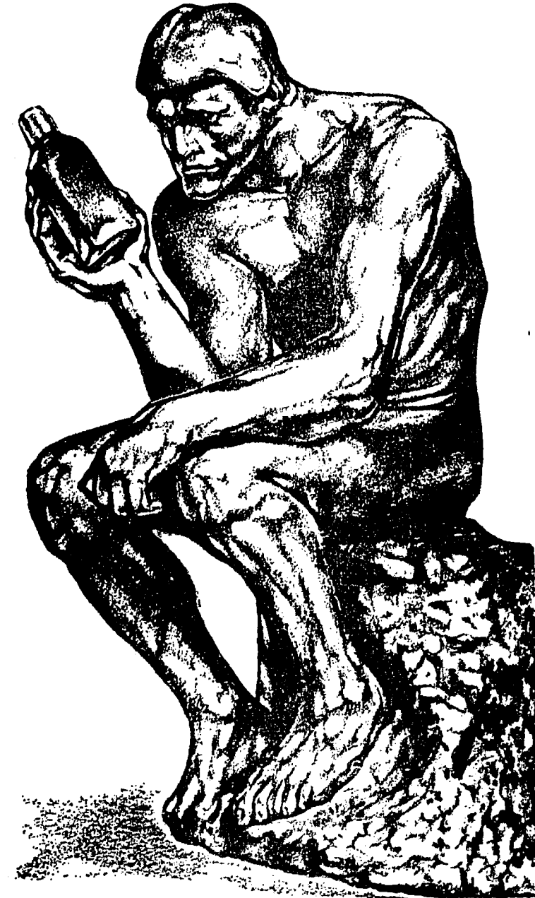
A public service of the Idaho Advertising Federation & Idaho Newspaper Association.