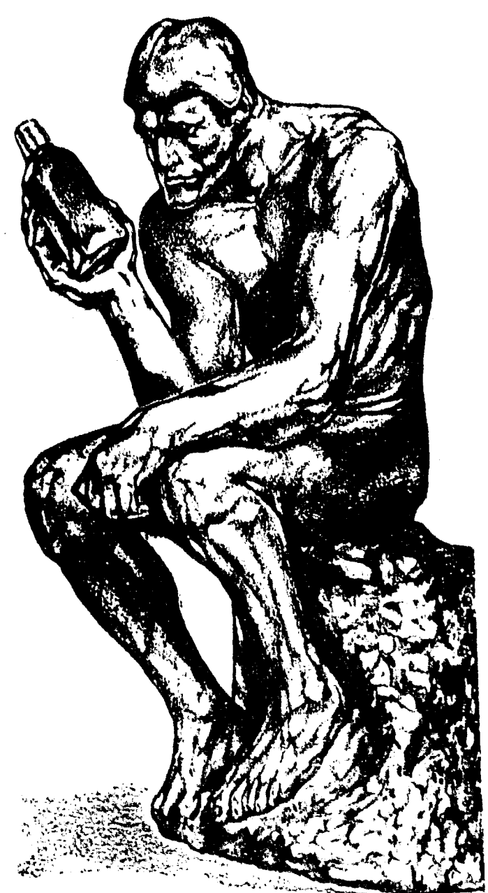
A public service of the Idaho Advertising Federation & Idaho Newspaper Association.