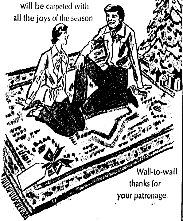
Wall-to-wall thanks for your patronage.

We hope your Christmas will be carpeted with all the joys of the season