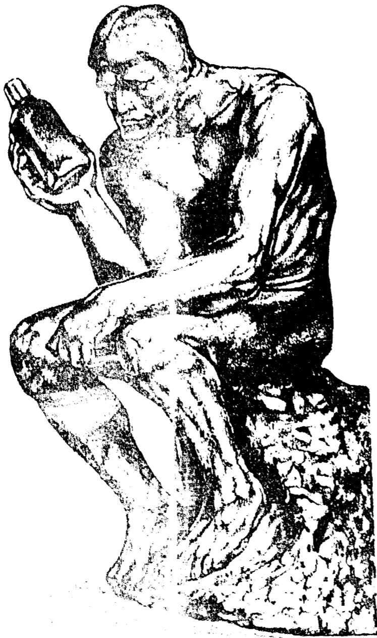
A public service of the National Advertising Education & Idaho Newspaper Association.