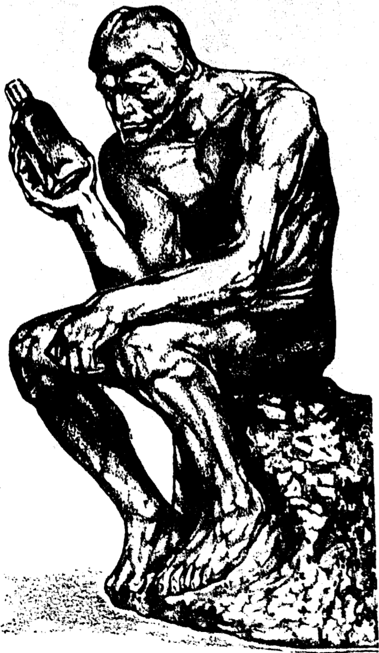
A public service of the Idaho Advertising Federation & Idaho Newspaper Association.