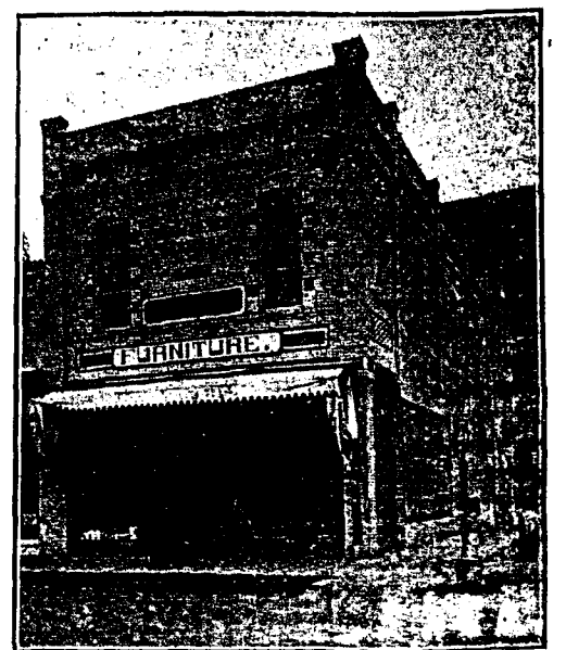
The Fraternal Temple building, a proud Kendrick landmark since 1905, has served a number of businesses.