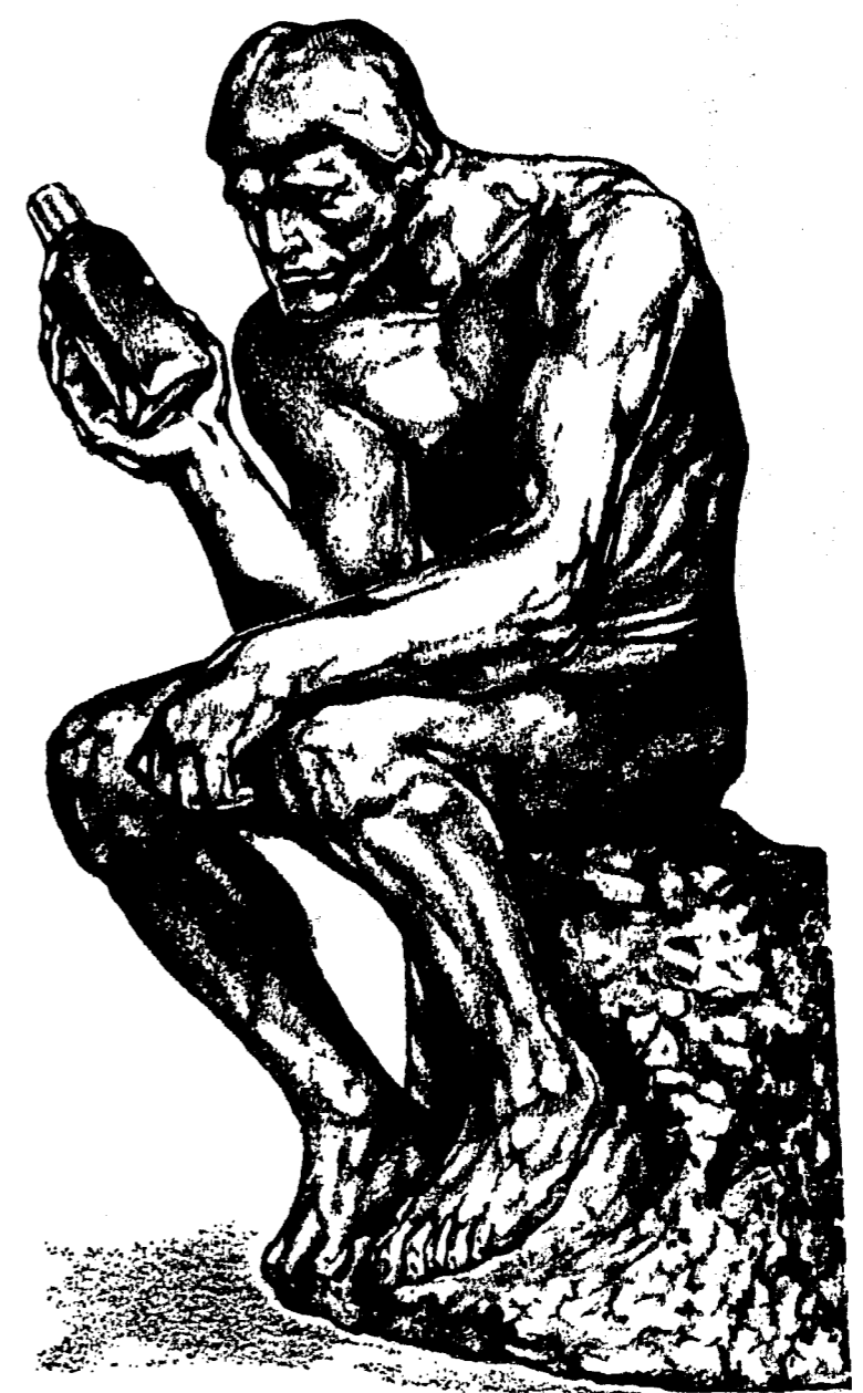
A public service of the Idaho Advertising Federation & Idaho Newspaper Association.