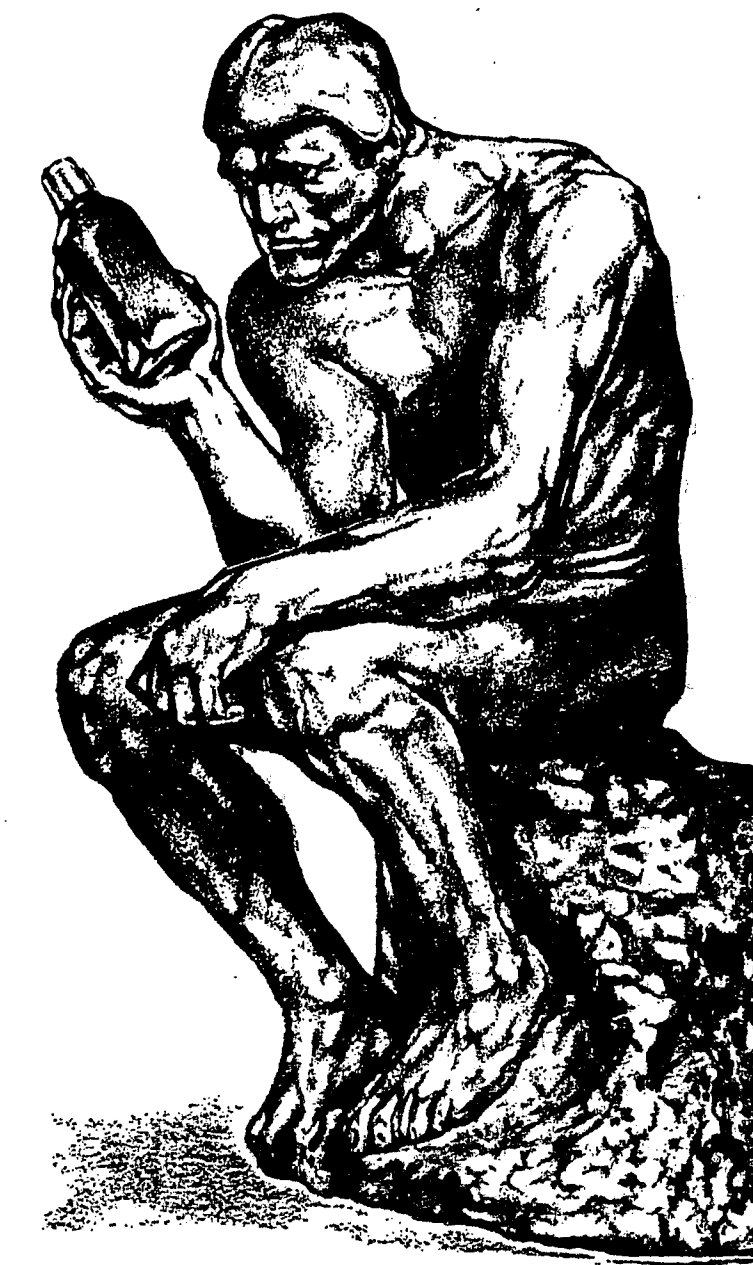
A public service of the Idaho Advertising Federation & Idaho Newspaper Association.