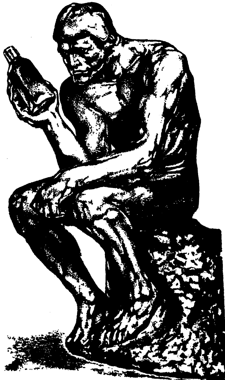
A public service of the Idaho Advertising Federation & Idaho Newspaper Association.