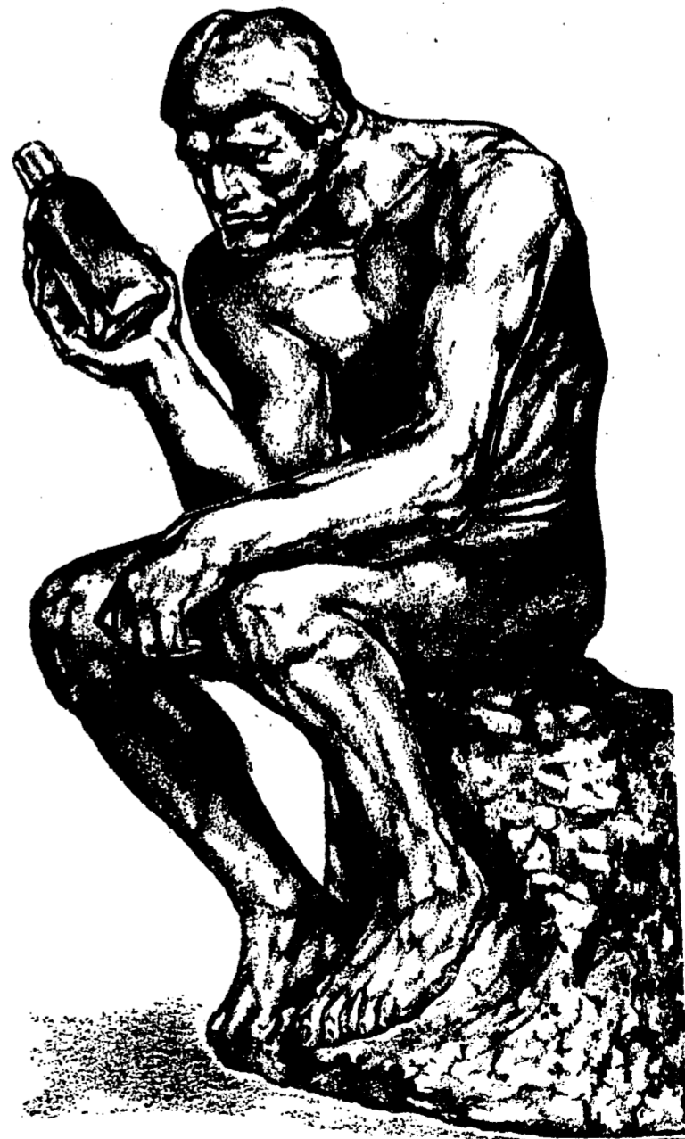
A public service of the Idaho Advertising Federation & Idaho Newspaper Association.