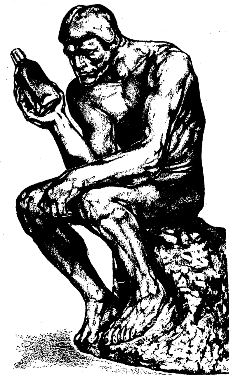
A public service of the Idaho Advertising Federation & Idaho Newspaper Association.