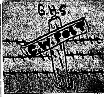
1 C. W. POST

We have entered the month of December and soon Christmas will be upon us. Children daily go through the Christmas catalogs dreaming of the toys they would like Santa to bring them. While the children make their long lists, parents begin to worry about how they are going to be able to afford everything. Folks there are only 22 shopping days left.