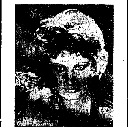
Styling of the Month from