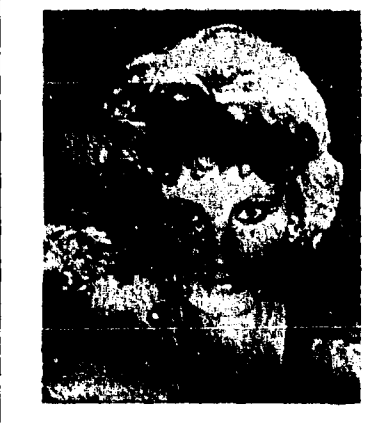
Styling of the Month from