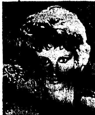
Styling of the Month from