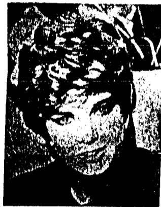
Styling of the Month from