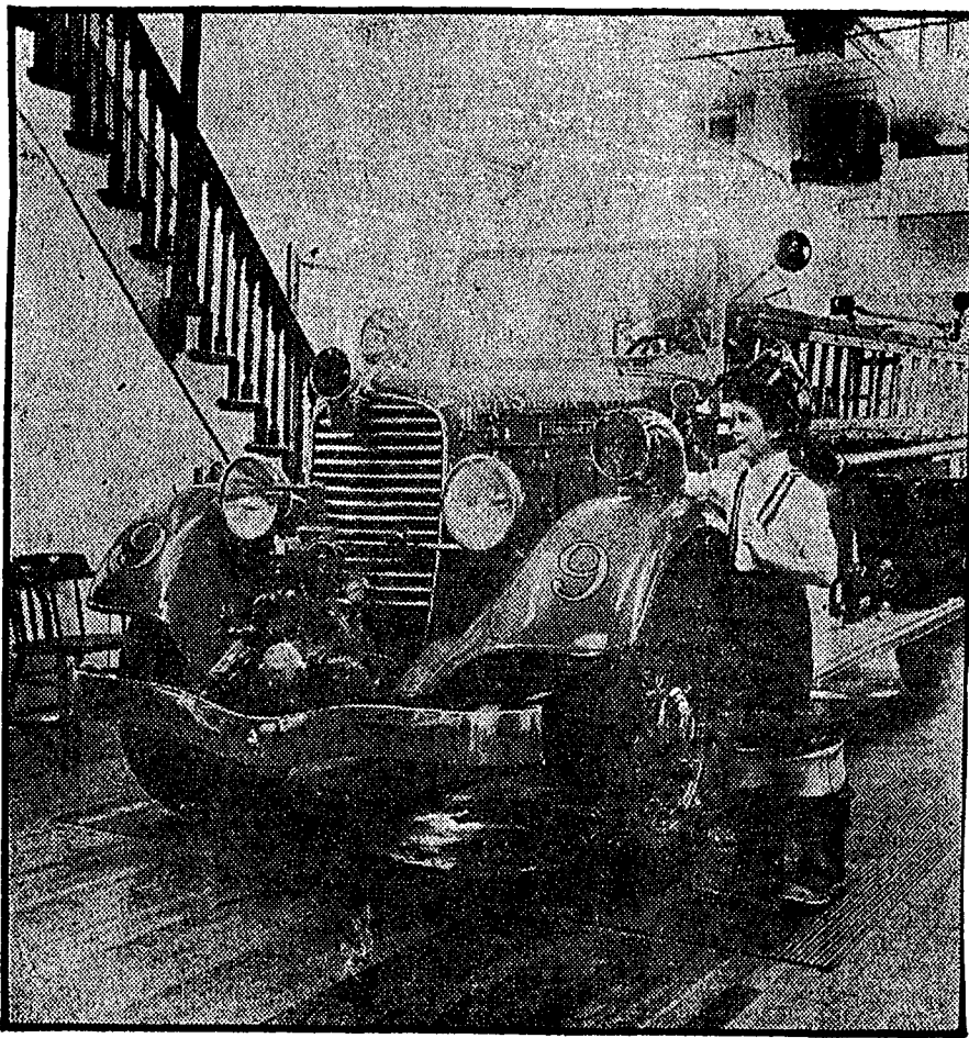
She wasn't your sleek, classic beauty, but the Chief and his boys kept her shined up and as spiffy as possible.