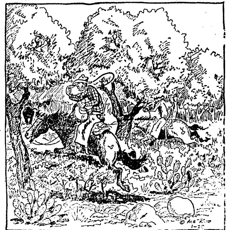
"The government is always helpin' us dig tanks and build fence, I just wonder if we could git 'em to help us gather these ole brushy steers."

Looking forward to that nice, long vacation? Change your money to travelers cheques! The safest way to spend your vacation is to take along travelers cheques instead of cash! Only YOU can cash them! Always obtainable at First Bank of Troy.