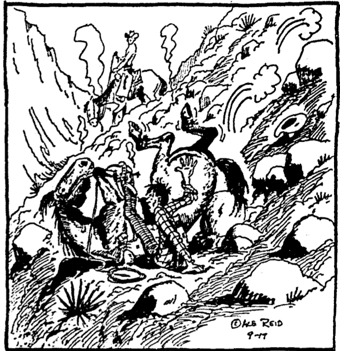
"Oh, I'm fine! Now how about gittin' busy and we'll visit some other times!"

If you need your valuable time for 'other things'—use our Time Saver Service—Bank-by-Mail! With your deposit receipts we will return to you new forms and envelopes for convenience at all times