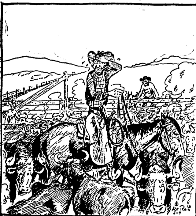
"Jake, she's right there—dark red—got her off Luke—you blind—see the spot on the left leg—cropped right ear—swaller fork in the left."

Valuables can so easily be lost or misplaced — even stolen and-or burned! Protection in a safe deposit box give you peace of mind! Rent one today — costs about a penny a day!