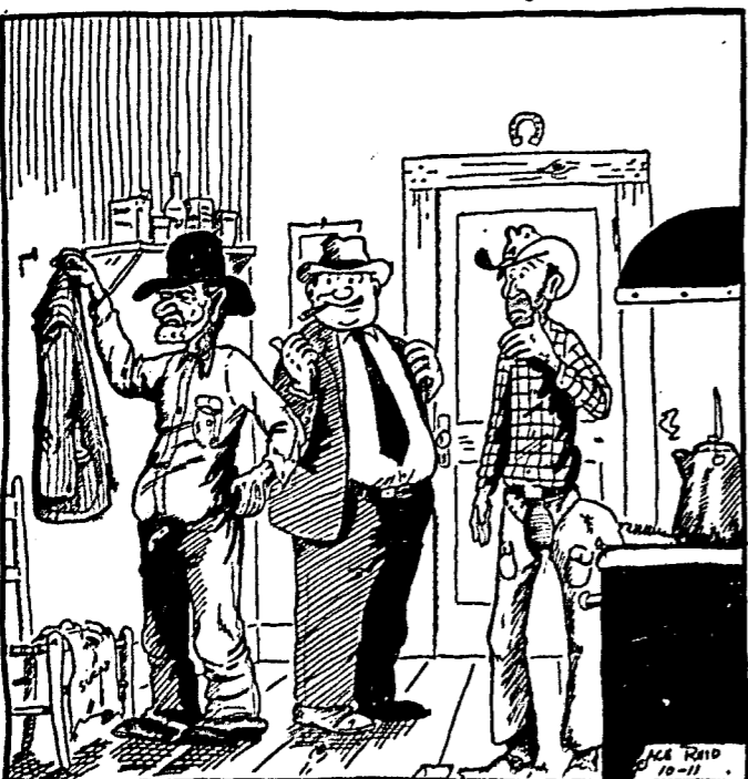
"Your cook's miserable disposition just got him elected President of the bank!"

Let us cure your financial ills with service by ALL our employees who maintain a friendly disposition at the time! Get complete banking service at First Bank of Troy