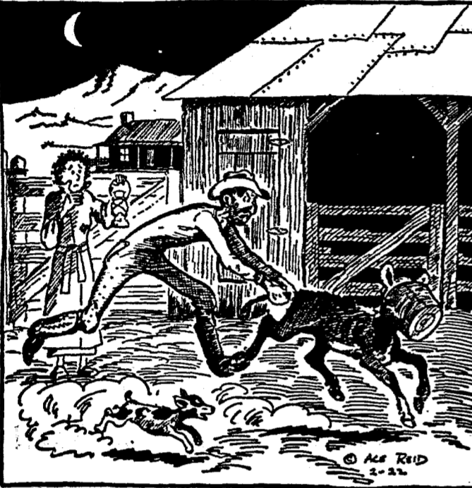
"Bellerin' all night! I jst wish you'd stuck your head in the feed grinder 'stead of a bucket!"

Little things mean a lot! Save a little now for a lot more in the future! Saving makes life more enjoyable now and later! Start your savings account today!!