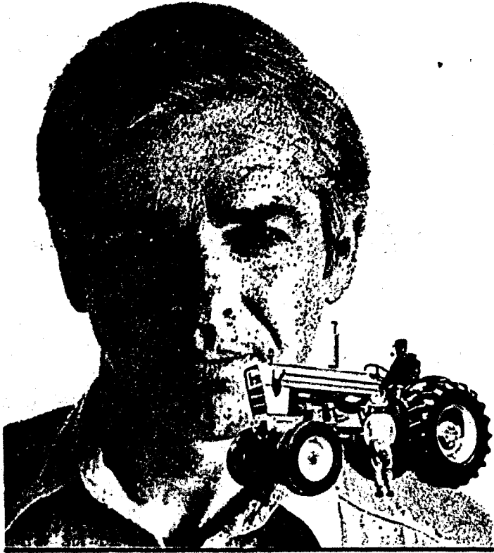
Aid Association for Lutherans in Appleton, Wisconsin Fraternal Life Insurance Life • Health • Retirement

Lutherans: Who will get the farm if something happens to you?