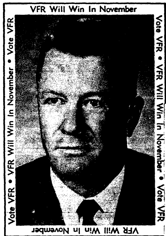
Vote VFR • VFR Will Win In November • Vote VFR