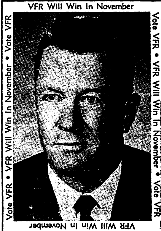
Vote VFR • VFR Will Win In November • Vote VFR