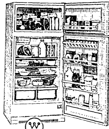
Model RJG 45