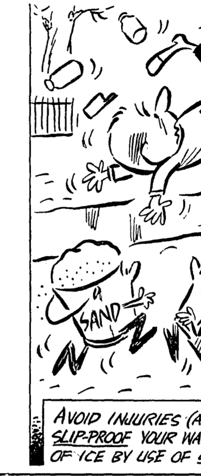
AVOID INJURIES (AND POSSIBLE LAWSUITS)... SLIP-PROOF YOUR WALKS - KEEP THEM FREE OF ICE BY USE OF SAND, SALT OR ASHES!