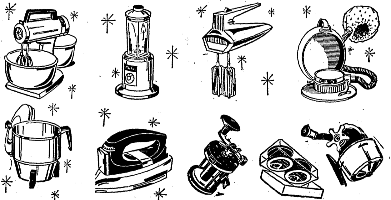
Similar to illustrations