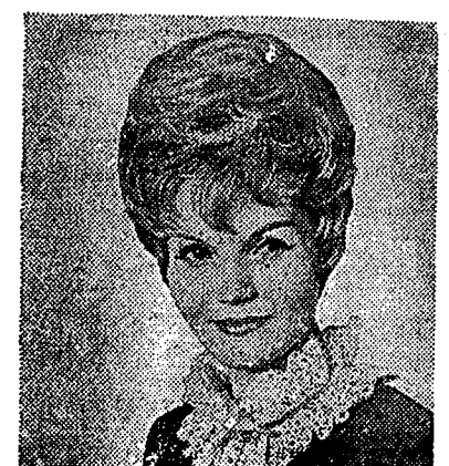
Shampoo and Style from $2.00 Phone 289-5727 OPEN 9:00 to 5:00