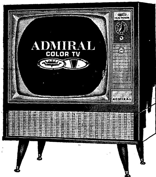
ADMIRAL® The SHELDON Model T1000 Color TV

Smart Contemporary table Color TV, featuring new Admiral-built 26,000-volt precision crafted horizontal chassis plus long range tuner with preset fine tuning. New 24 kt. gold precision wiring* insures greater chassis reliability, new Electronic Color Balancer, new Color TV Contrast Control. Front Alnico V speaker. 23 1/8" h., 30 3/4" w., 19 1/2" d. Model T1000—Charcoal finish on metal.