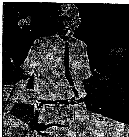
Call Me at SH 3-5555