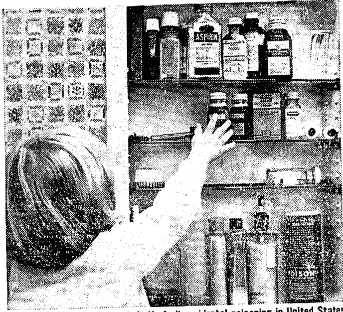
Medicines account for nearly half of all accidental poisoning in United States each year. Discard unused medicine and keep rest out of children's reach.