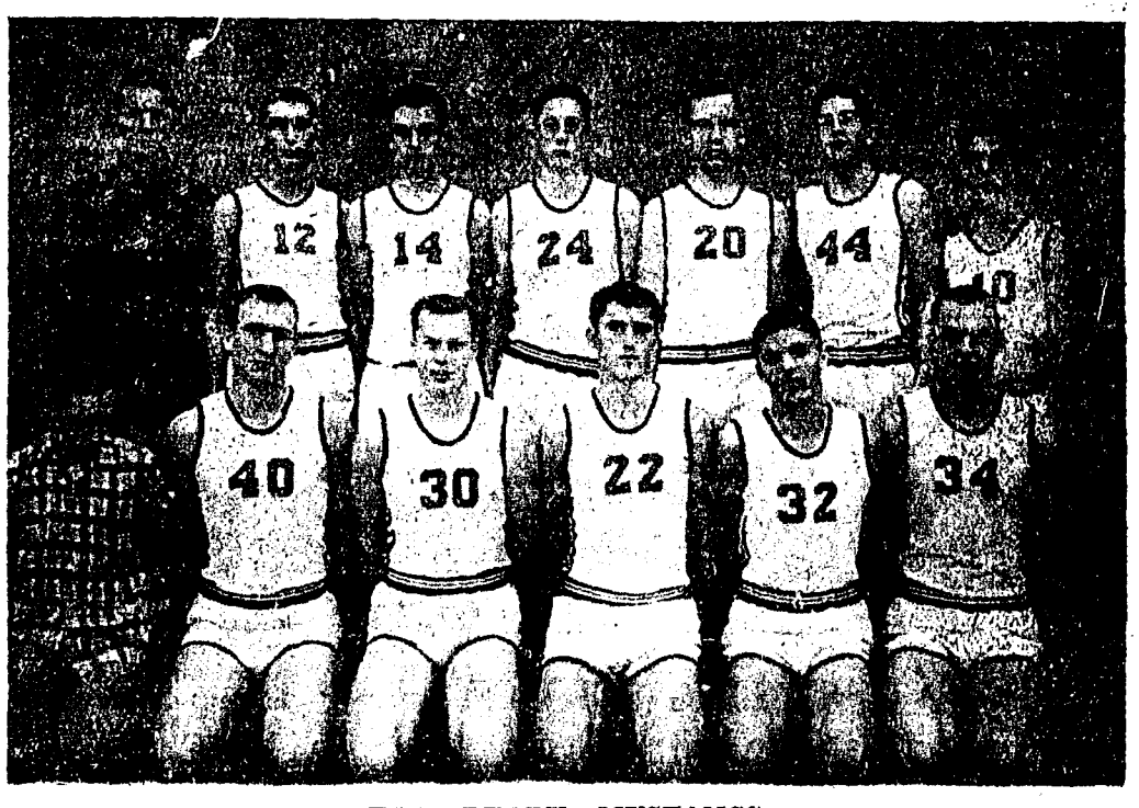
THE DEARY MUSTANGS

"tournament jitters." Dale Silflow of the Tigers drew the first blood with a gift toss, after two minutes of play. The quarter continued almost scoreless and ended with Elk River in the lead 8 to 6, the go-ahead coming on a pair of gift tosses.