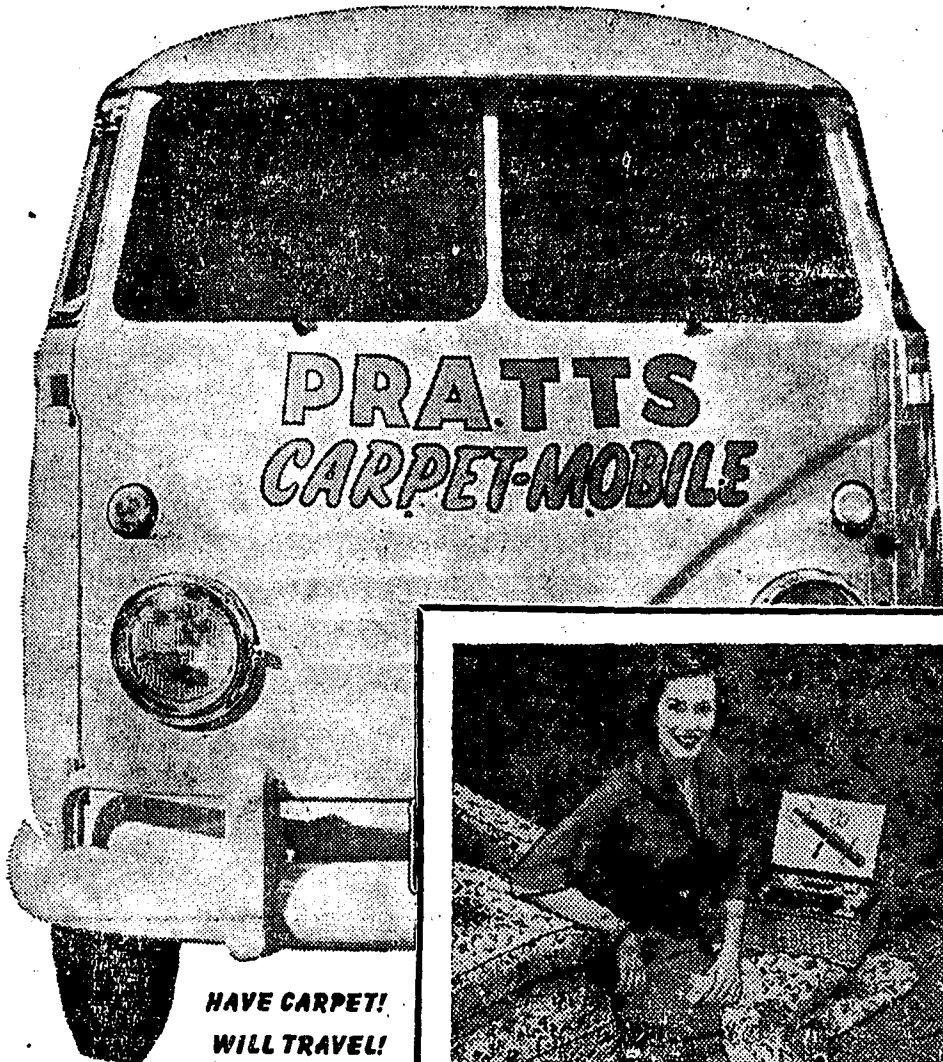
ANYWHERE IN WASH. IN IDAHO IN OREGON IN MONT.