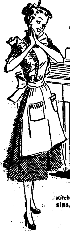
Kitchen Queen—two basins, two drainboards.

COME IN AND SEE FOR YOURSELF the glistening beauty, the functional design—the many extras to lighten kitchen tasks. All this is yours when you choose a new Crane sink. You'll find Crane offers a most complete selection, too, with a style and size for every kitchen—and for every budget.