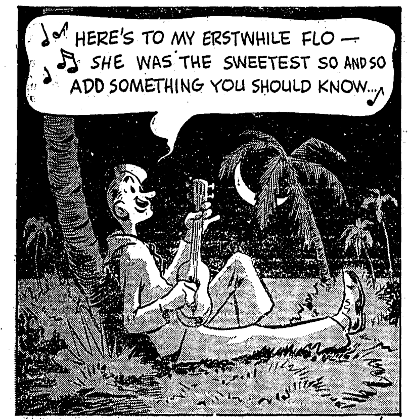
That It Takes Fertilizer from Abrams Hardware to Make the Green Grass Grow!

is the time to start thinking about that lawn and flower bed fertilizer —