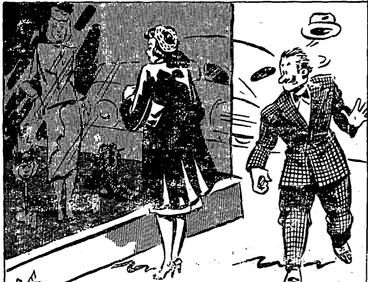
Alice Blue Gown, in shopping our town came looking for values safe and sound and now she tells where they are found...