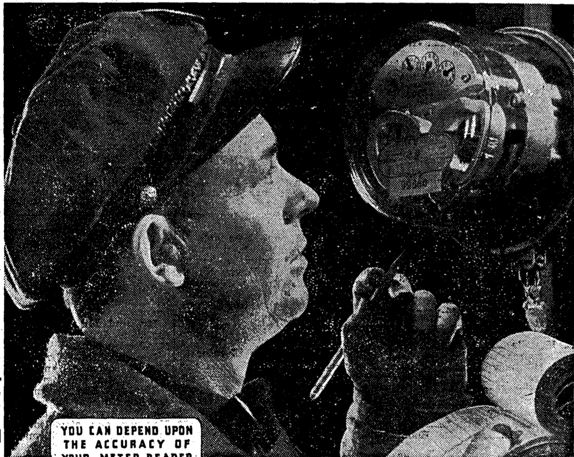
YOU CAN DEPEND UPON THE ACCURACY OF YOUR METER READER

Member Federal Deposit Insurance Corporation